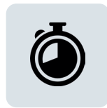
FASTER AND EASIER